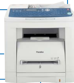
550-sheet 2nd Paper Feed Module DA-DS188

Accounting Software DA-WA10 *Requires additional SD memory